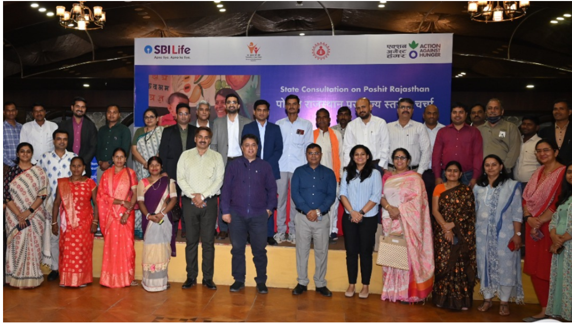
State Level Consultation on Poshit Rajasthan, which focused on discussing learning and analysing policy options concerning the issue of child malnutrition in Rajasthan.