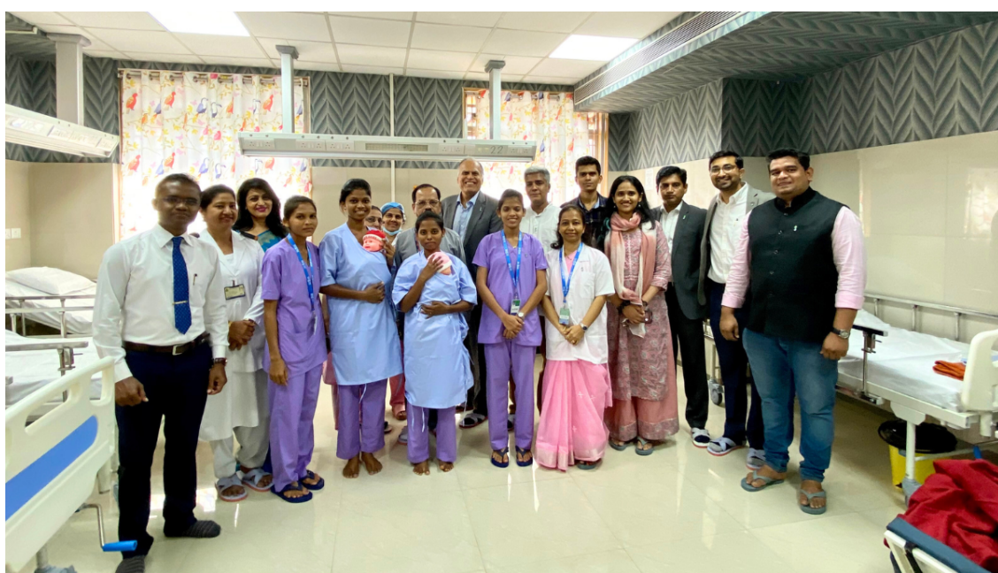
Kangaroo Mother Care: Enhancing the Survival and Well-being of Newborns.